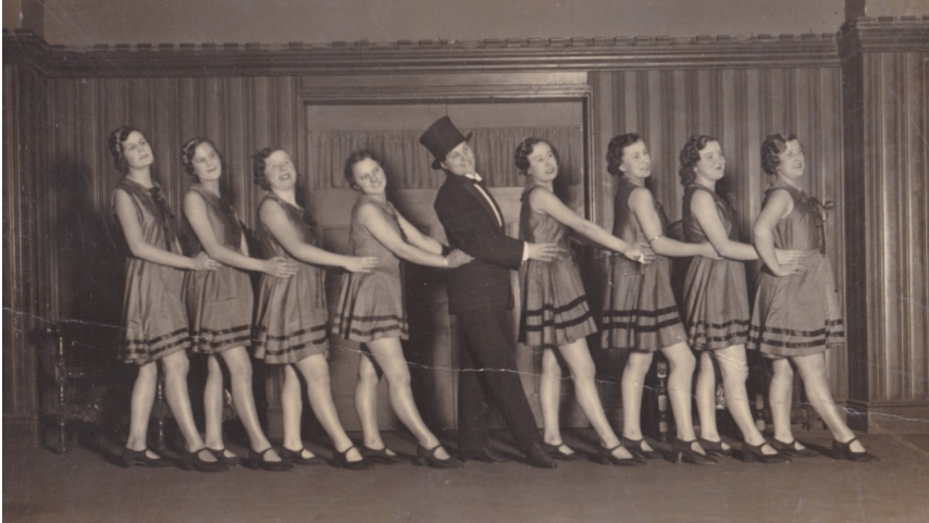
Sanway Road area)

This top photo shows the Sanway Laundry staff. We would love to hear from you if you think you recognise anyone in it, or where the photo was taken (we think perhaps in the